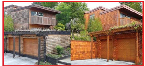
Cedar Shingles After Mold X

professional grade detergents & solutions